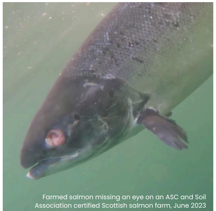
Farmed salmon missing an eye on an ASC and Soil Association certified Scottish salmon farm, June 2023

Similarly, the RSPCA Assured standard, which claims to be welfare led, sets no maximum mortality threshold limits on certified farms. Consequently, Scottish salmon farms reporting as many as 74% of its fish dying in a single month can continue to sell the remaining fish as RSPCA Assured-certified "high welfare" farmed salmon. In 2022 more than 16.7 million salmon died prematurely on Scottish salmon farms, with no loss of RSPCA Assured certification publicly reported because of these record high mortalities.