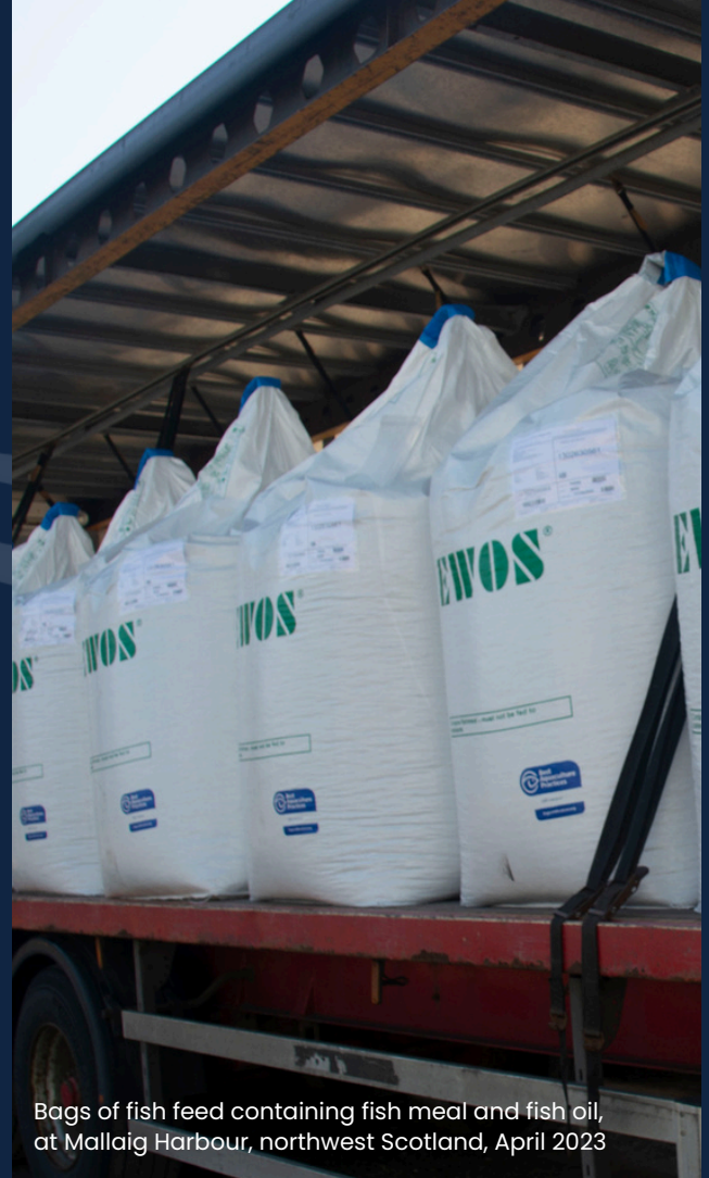
Bags of fish feed containing fish meal and fish oil, at Mallaig Harbour, northwest Scotland, April 2023

The Feed Standard states that 100% of marine-derived feed ingredients used by a certified feed producer must be MSC certified – but lacks any concrete timeline for this, instead stating that this time period "will be determined through the Standard revision process and on the basis of careful considerations of volume demand and availability."