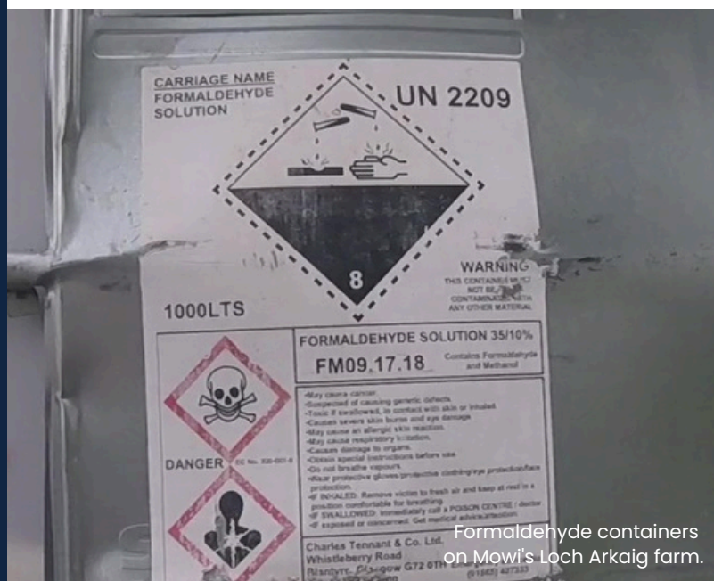
Formaldehyde containers on Mowi’s Loch Arkaig farm.

Formaldehyde use was recorded 4 times in 2018, 3 times in 2019, and on at least one occasion in 2020 and 2021 at Mowi’s Loch Arkaig freshwater farm, which is certified by the Soil Association as organic.[38,39] Similarly, a report by the Fish Health Inspectorate (FHI) in 2022 found that Cooke Aquaculture Scotland used formalin (Aquacen) on its Soil Association certified organic freshwater hatchery, Cairndow Hatchery, in 2021.[40]